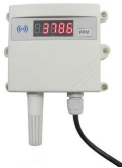
Fig. 3 AN YING Smart Farming CO 2 sensor.