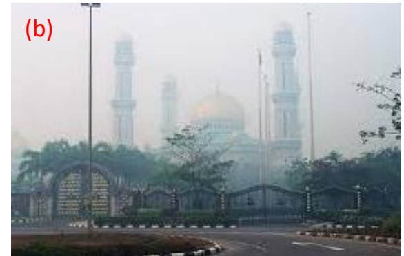
Fig. 2 Haze season in Brunei Darussalam at: (a) Peatland area, and (b) City center.