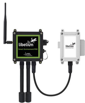
Fig.4 LIBELIUM Smart Environment Pro.