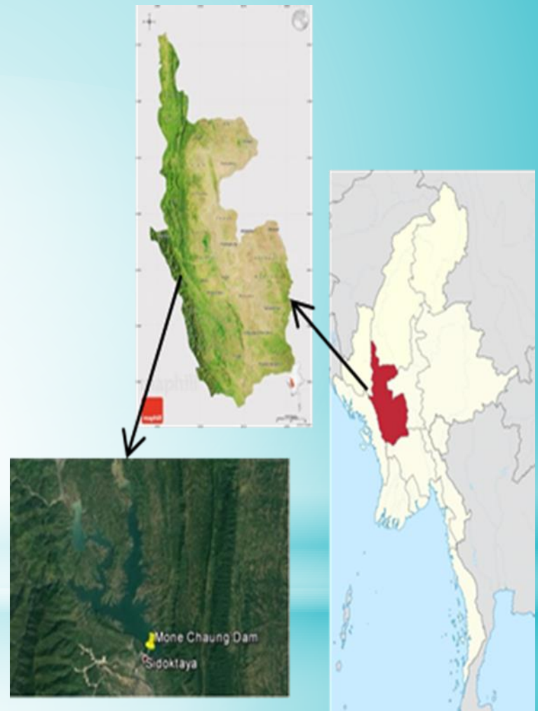
Figure1. Location of Mone Chaung Dam