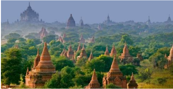
Ancient Bagan Region