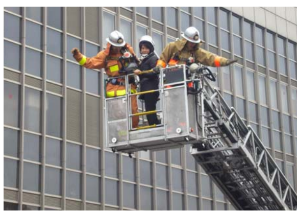
Rescue drill from roof using an aerial ladder truck