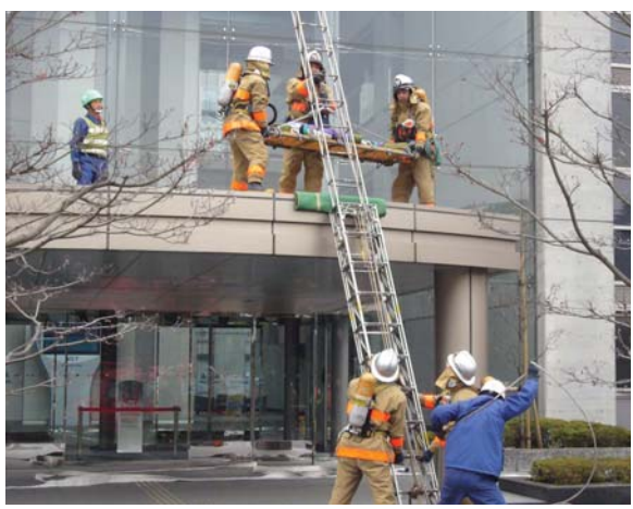
Elevated rescue drill