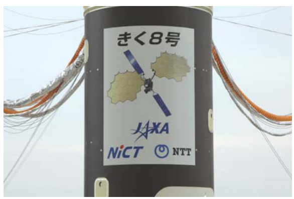
A logo designed jointly by the three organizations depicted on the upper part of the H-IIA launch vehicle No. 11