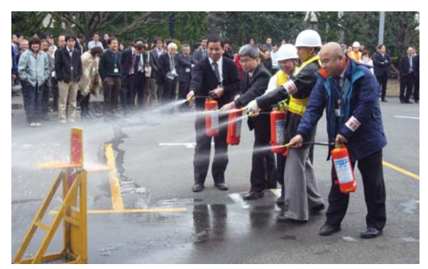
Initial extinguishment drill